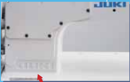
Embossed JUKI mark